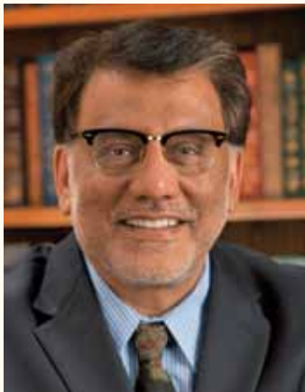
Liaquat Ali Khan Professor of Law