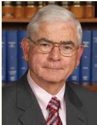
Joseph E. McKinney Visiting Professor of Law