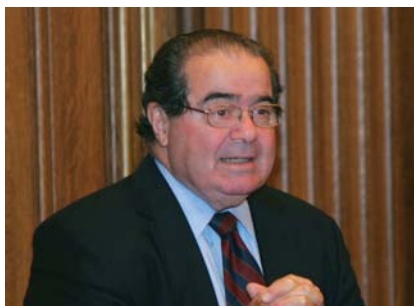
Supreme Court Justice Antonin Scalia