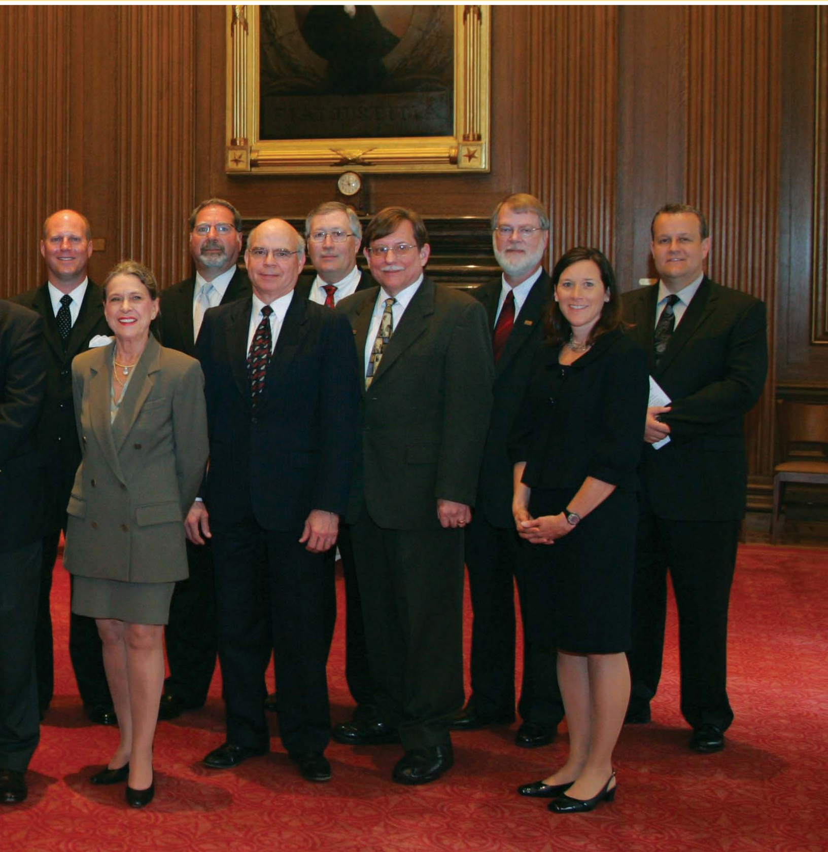
Washburn Law Alumni Admitted to the Bar of the U.S. Supreme Court