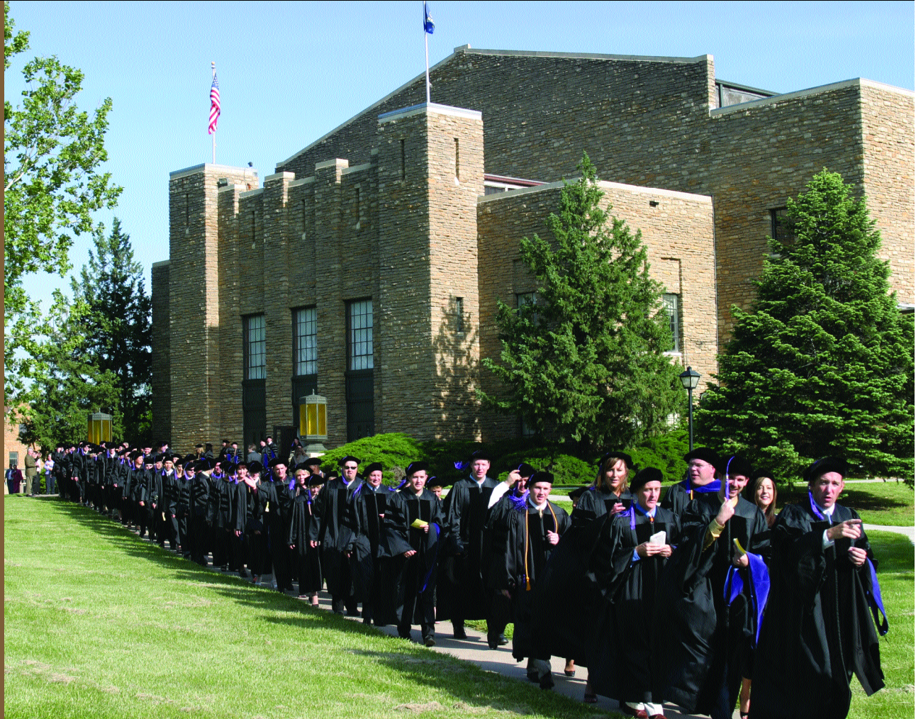
Above : Graduation Procession to Lee Arena