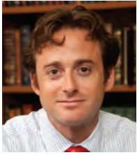
David Rubenstein Professor of Law Center for Law and Government Director