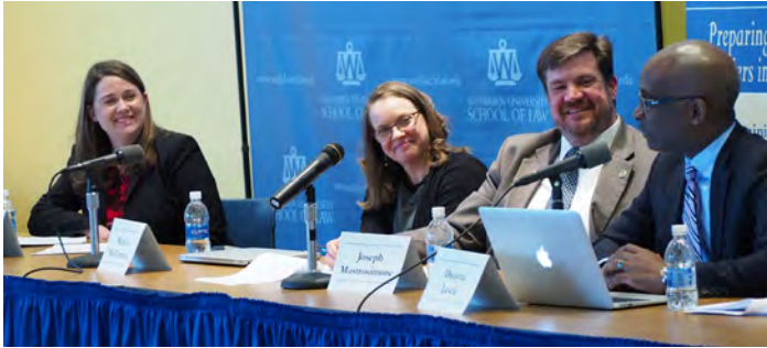
Panel 2 speakers