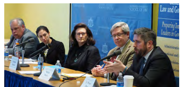
Symposium Panel 1 speakers