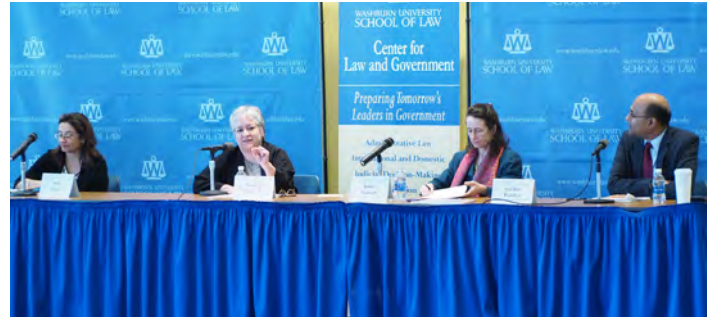
Panel 3 speakers

extend Title VII protection for gender identity and sexual orientation.