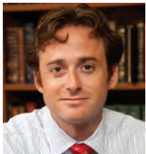
David Rubenstein Professor of Law

The Robert J. Dole Center for Law and Government at Washburn Law offers cutting-edge programming and student opportunities in public law and administration. As one of six centers at our Law School, the Center for Law and Government connects our students to federal, state, and local government. In 2018, preLaw Magazine ranked Washburn Law #3 in the nation for government law, which is a